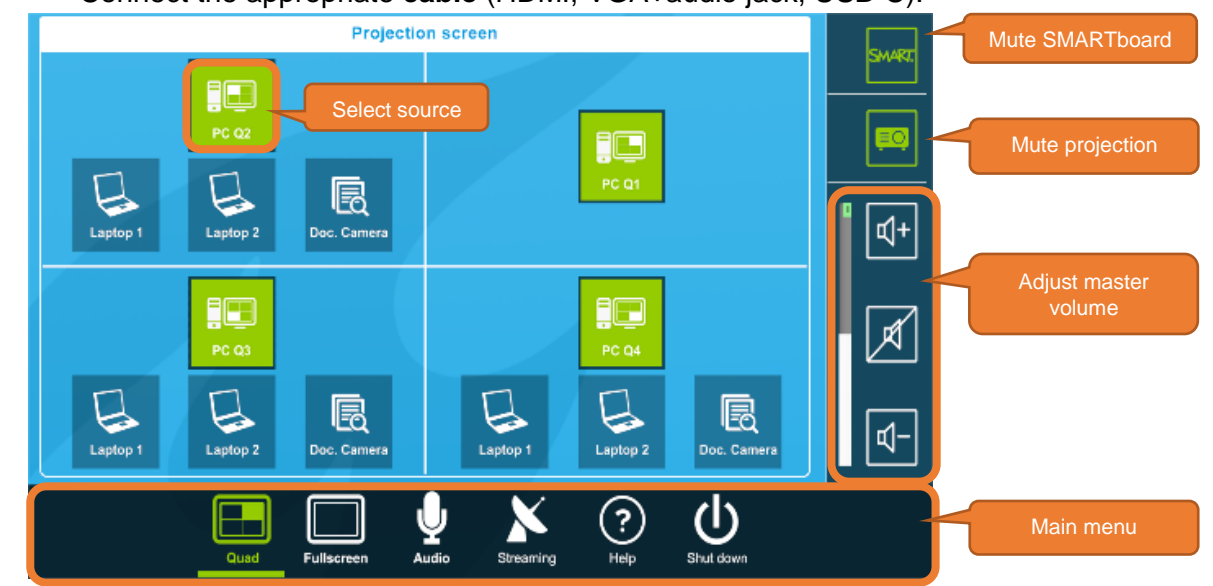
Select Full Screen to present one source.